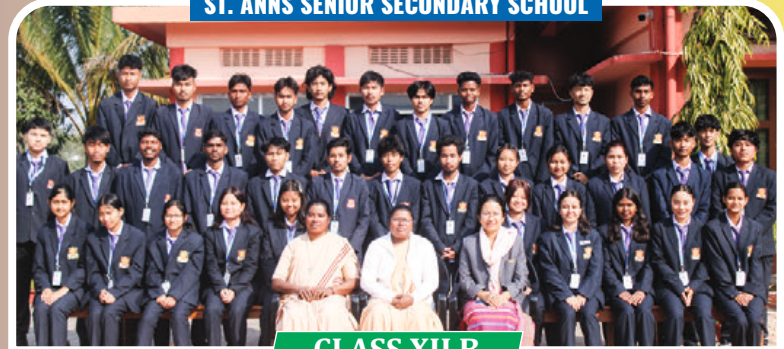
CLASS XII B