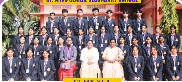
CLASS XI A