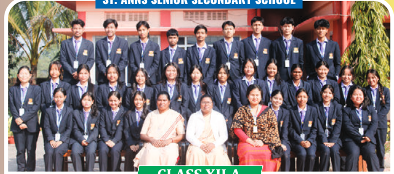
CLASS XII A