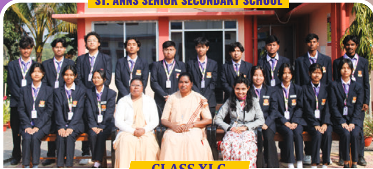
CLASS XI C