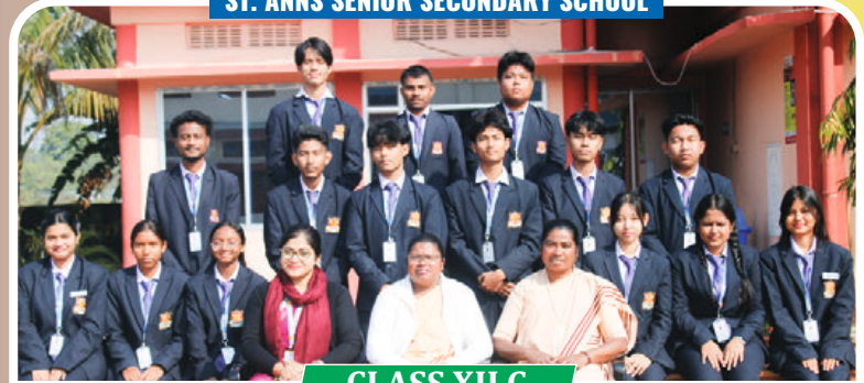
CLASS XII C