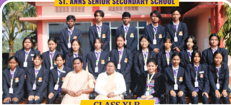
CLASS XI B